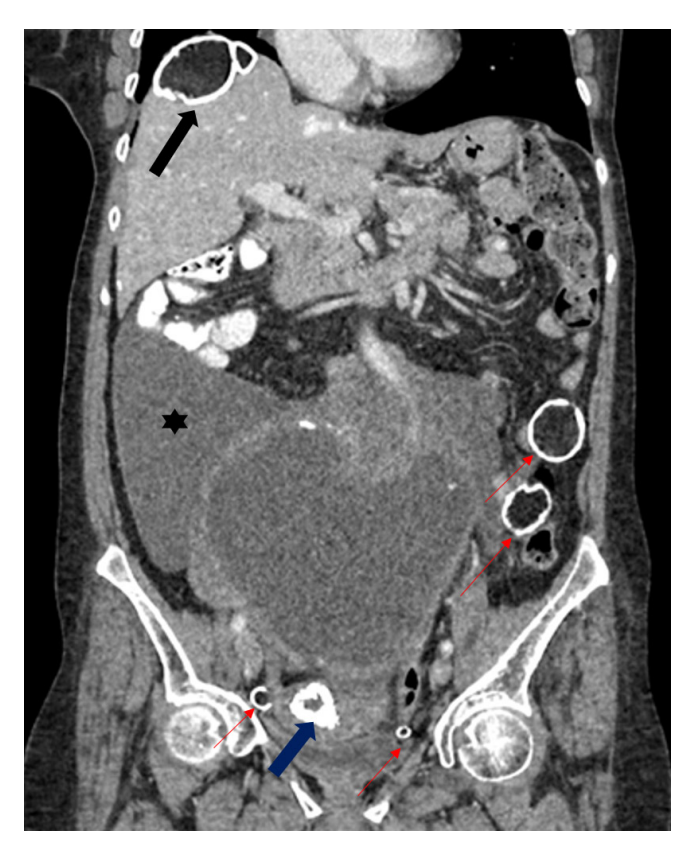
Figure 4. Contrast-enhanced computed tomography in coronal view demonstrating multiple well defined rounded lesions with calcified walls at the left paracolic region and pelvic cavity (red arrows). The largest lesion at subdiaphragmatic space is scalloping the superior margin of the liver (black arrow). Calcified lesion within the uterus is a leiomyomata (blue arrow). A rupture at the right lateral wall of the mass is seen, resulting in a leak and formation of the adjacent collection at the right paracolic region (star).

from the left ovary. It occupied the pelvic cavity and extended superiorly till the upper abdomen (L1 level). The mass was mainly of cystic components surrounded by wall calcifications. It also contained fat and soft tissue component. A focal defect in its wall suggested a rupture complicated with adjacent collection (Figure 3). Multiple wells defined, rounded lesions with wall calcifications were seen scattered in the abdominal and pelvic cavity. The largest lesion is seen in the right subphrenic region and scalloped the superior liver margin (Figure 4). The CT concluded the presence of left ovarian teratoma with an area of defect likely representing a rupture complicated with the adjacent collection. Multiple peritoneal lesions with the calcified wall are likely peritoneal implants (gliomatosis peritonei). Histopathology revealed that the left ovarian tumour to be a mature cystic teratoma with extensive fibrotic and calcified walls. Omental and peritoneal nodules revealed calcified and fibrotic mature implants with no malignant transformation. Pap smear was negative for malignancy.