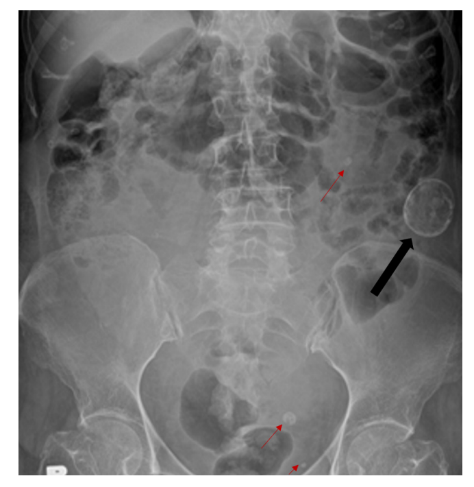
Figure 2. Plain abdominal radiograph shows a large, welldefined lesion with calcified wall at left iliac fossa (black arrow). Similar lesions but smaller in size are seen at the left hypochondriac and left pelvic cavity (red arrows).